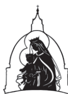
Totus Tuus Toronto

The youths of St. Jerome's Parish are invited to join us for Totus Tuus (Latin for "Totally Yours") this summer from July 26 – July 31, 2026 .