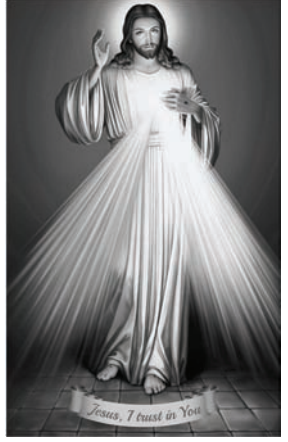
DIVINE MERCY SUNDAY April 28, 2019, 8:00 a.m. – 6:00 p.m.

If you have forgotten your envelope for Mass, please use the pick visitor envelopes and include your information or envelope number to be credited for your donation. DO NOT remove envelopes from the un-assigned offertory boxes.